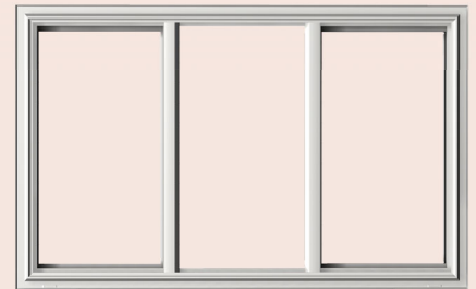
Equal Configurations 1/3 - 1/3 - 1/3