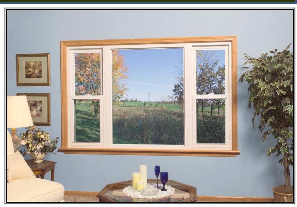
Picture window with mulled double-hung units, with & without colonial grids