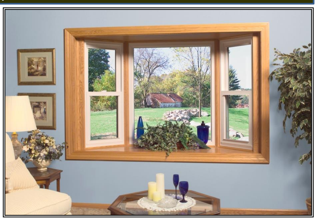
Double-hung bay with fascia extension to soffit & with shingled hip style roof