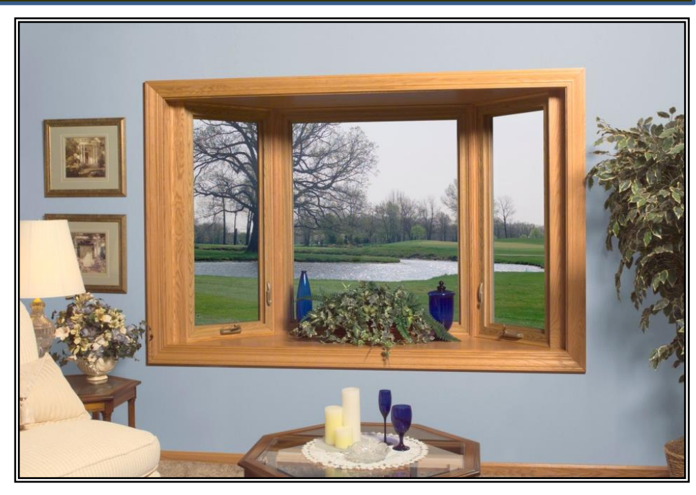
Casement bays with & without colonial grids